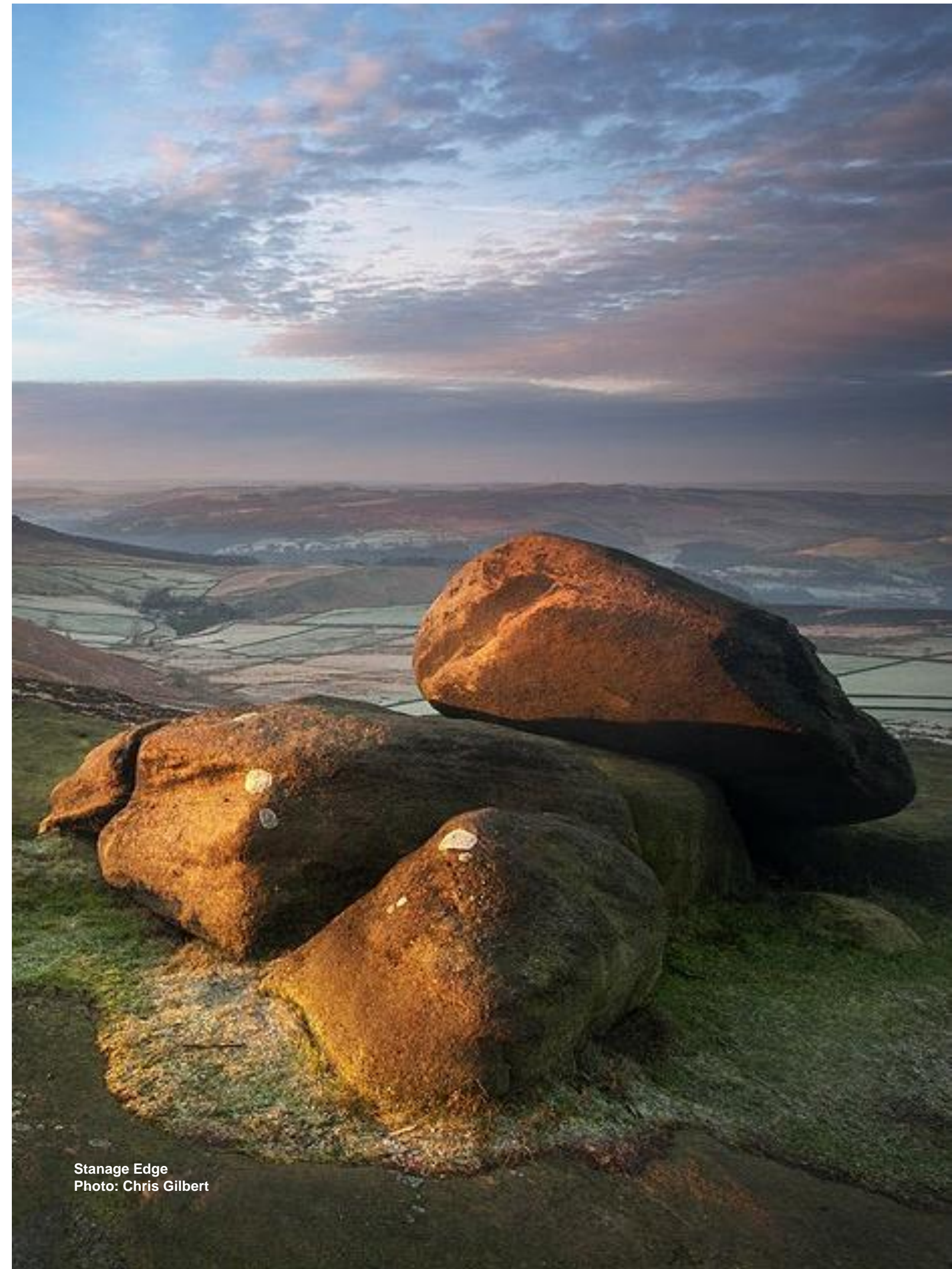
Stanage Edge

To enable local businesses to thrive in a way that is compatible and, wherever possible, enhances the special qualities of the Peak District National Park, we will assist the development of businesses in conjunction with relevant bodies. Linking business support, grant aid, planning and economic development.