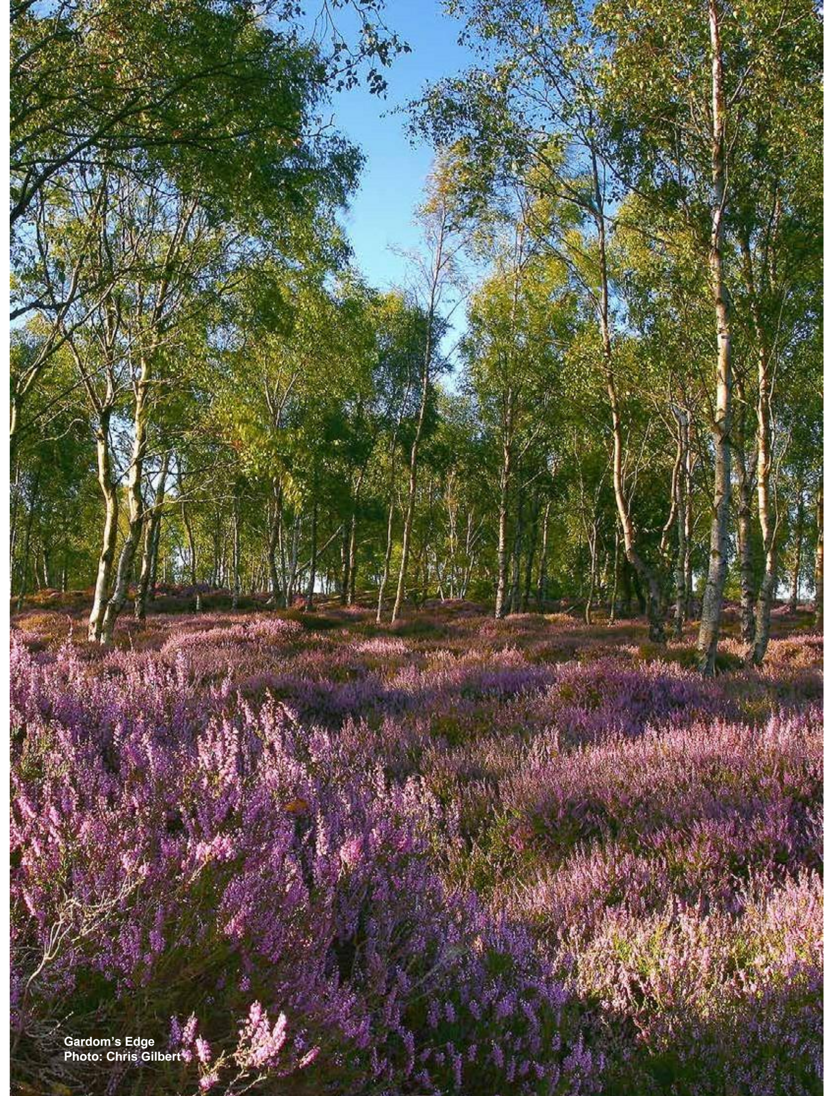
Gardom's Edge

To ensure shared responsibility we will review and develop the new public events system with its new guidance and code of conduct for events organisers. This will happen once the lockdown arrangements have been lifted and we can reflect properly on the way forward.