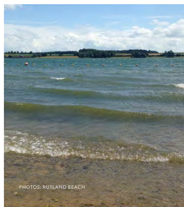
PHOTOS: RUTLAND BEACH