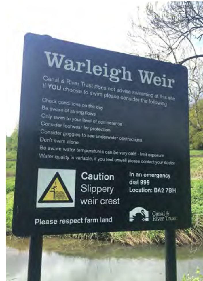
An example of good signage at an unsupervised site.

Find it at: wildswim.com/church-stretton-reservoir