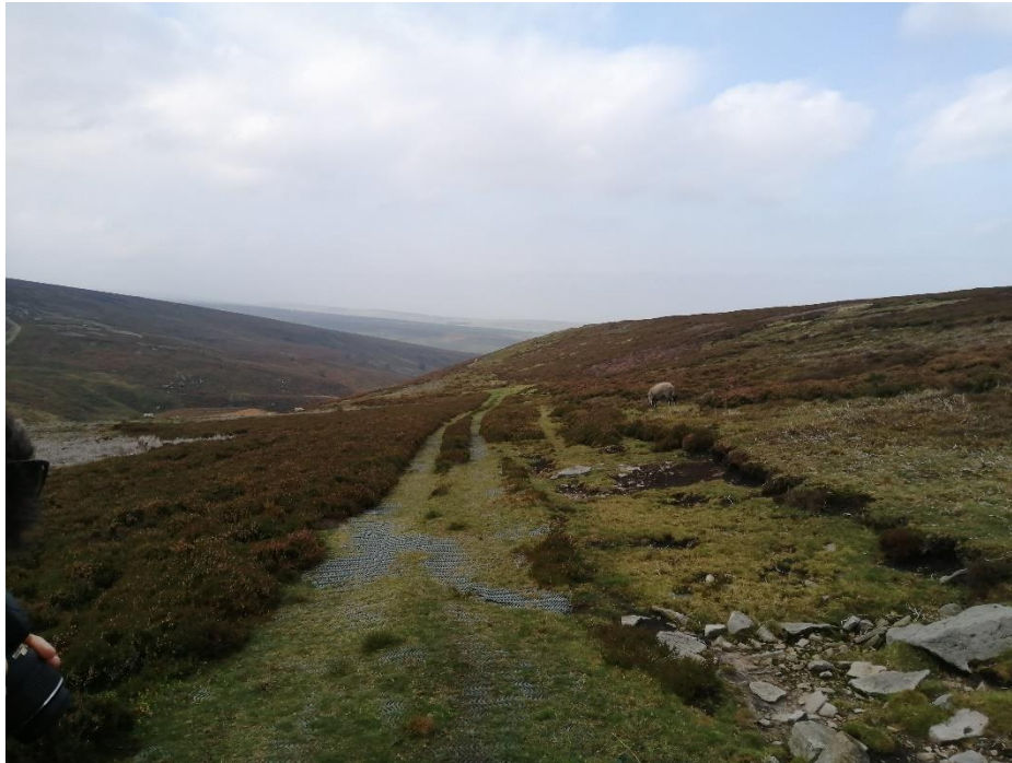
Figure 5 Heather brash cut alongside the track and used to repair eroding surfaces