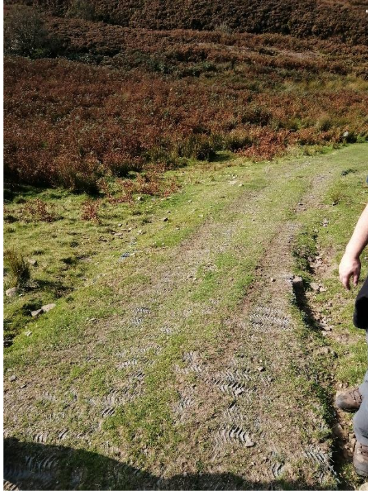
Figure 1 Midhope Moor track 2020 – the track is starting to break up in a number of locations along the clough. Limited vegetation growth on the mesh (probably as it is laid on a crushed stone).