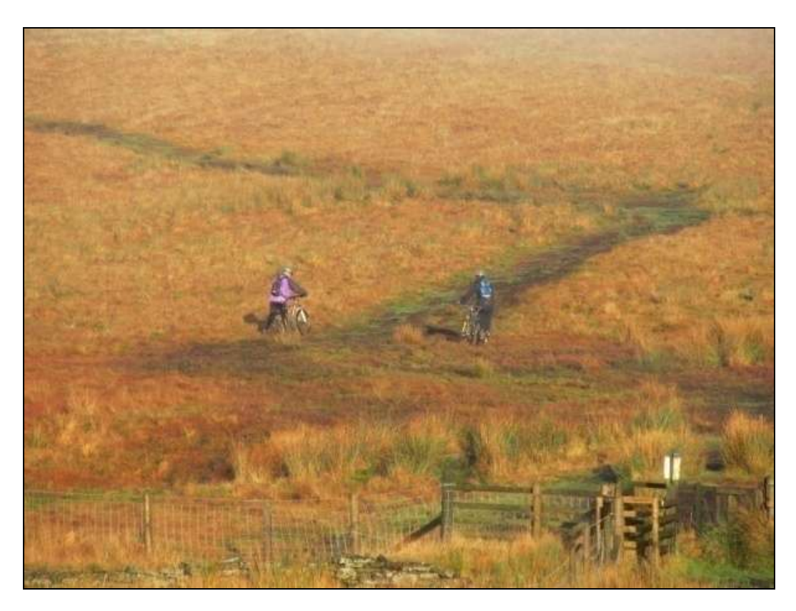
Plate A Mountain bike and foot path damage in the West Pennines.