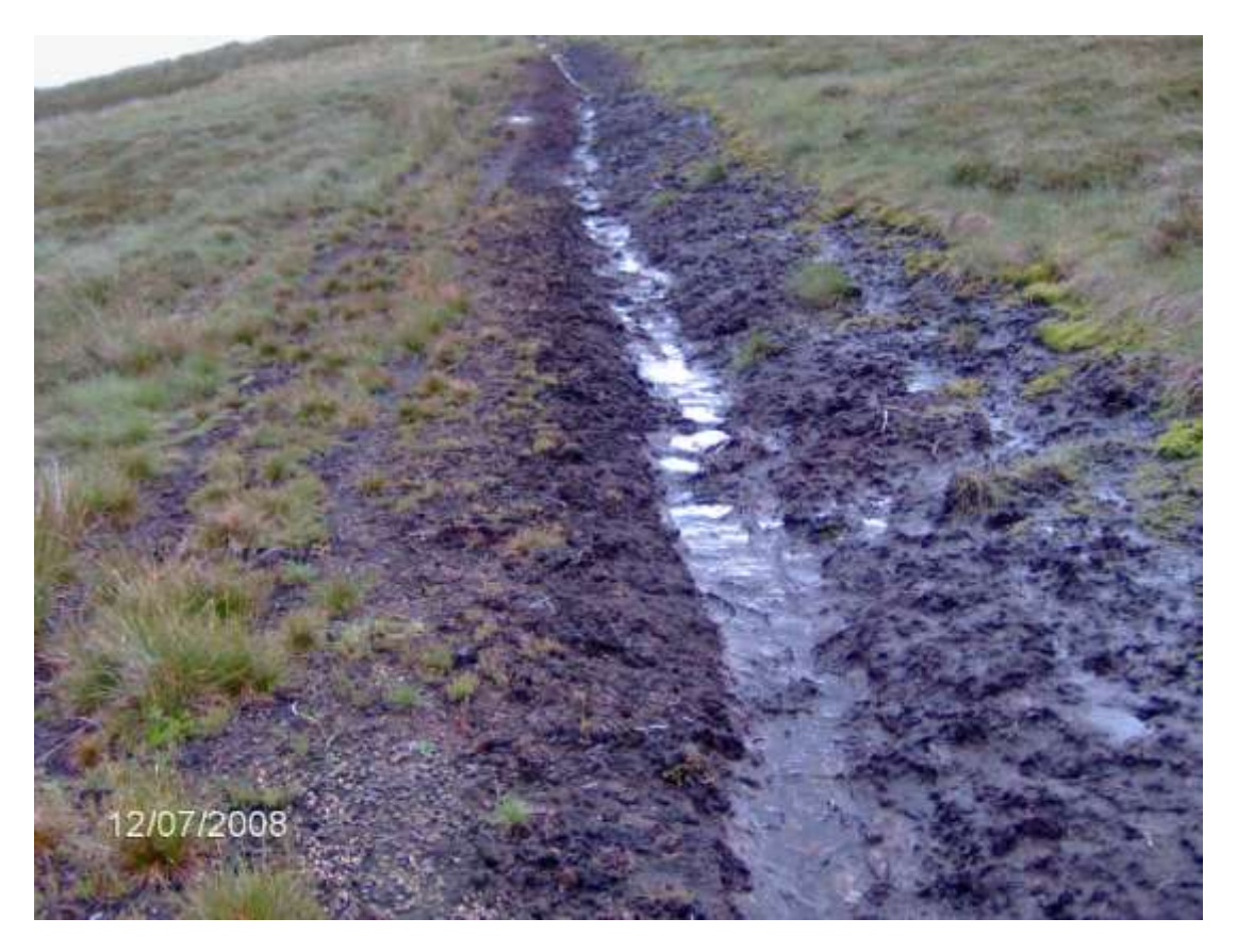
Plate C An example of track damage submitted to the Uplands Evidence Review.