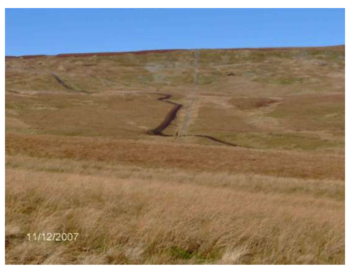
Plate D An example of track damage submitted to the Uplands Evidence Review. Photo: A. Peart, 2007.

Plate C An example of track damage submitted to the Uplands Evidence Review. Photo: A. Peart, 2008.