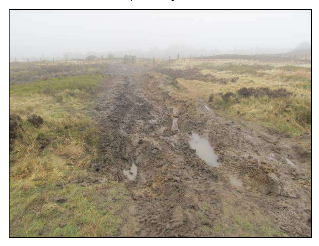
Plate B Vehicle damage in the West Pennines. Photo: United Utilities.The impacts of tracks on the integrity and hydrological function of blanket peat

Plate A Mountain bike and foot path damage in the West Pennines. Photo: United Utilities.