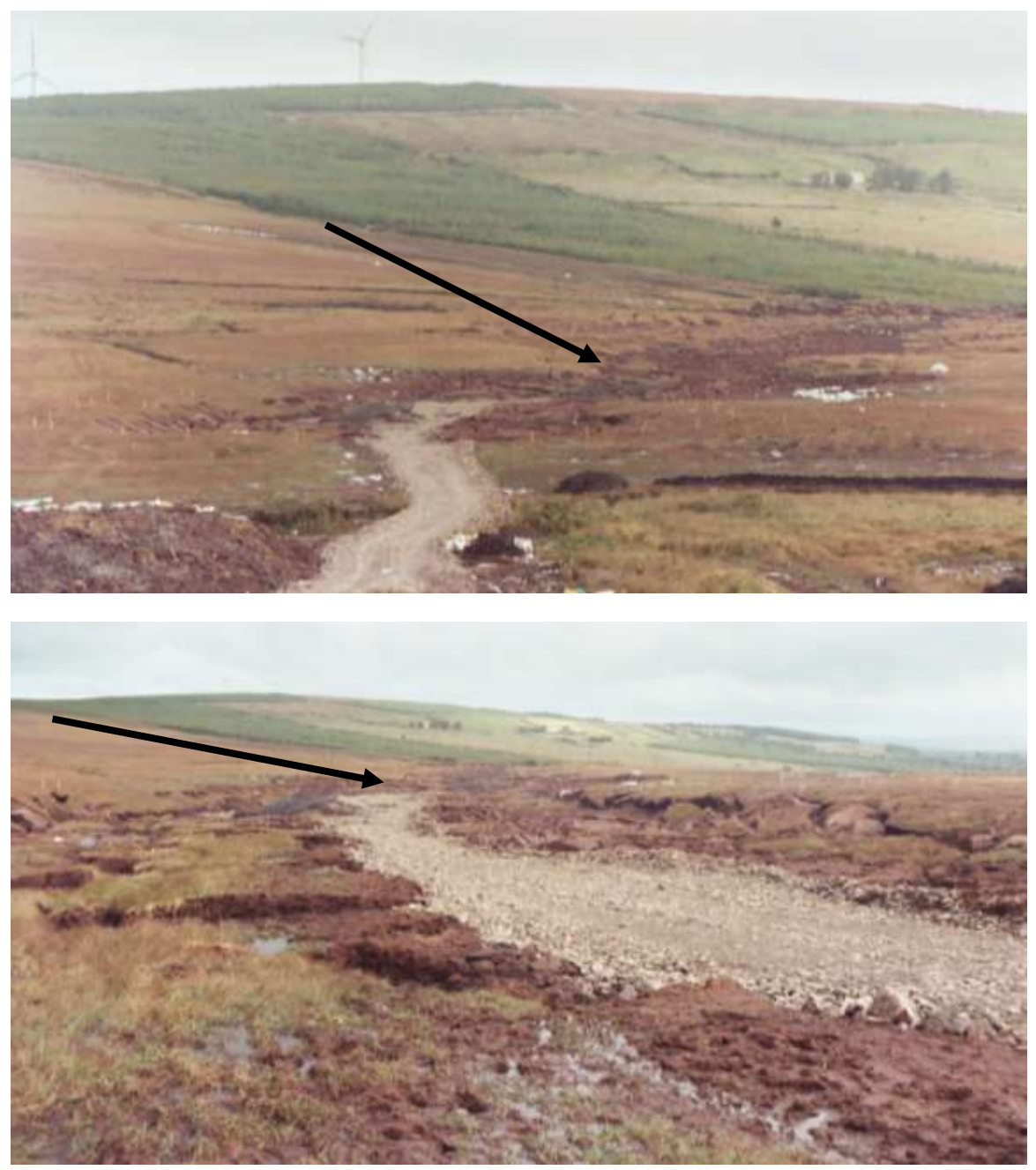
Both photos: A P Dykes (16 September 2008).

Figures 2 and 3 On 22 August 2008, work to construct a 'floating road' on 3 m deep blanket peat, to provide access for a new wind farm on Ballincollig Hill, Co. Kerry, Republic of Ireland, triggered a 130,000 m<sup>3</sup> landslide (see paragraph 3.30 for evidence statement). Peat- cutting activities 10 years earlier constituted a contributory factor in this event. The photos show the site after about 100 m of destroyed road had been rebuilt into the landslide area in order to facilitate recovery of the construction plant