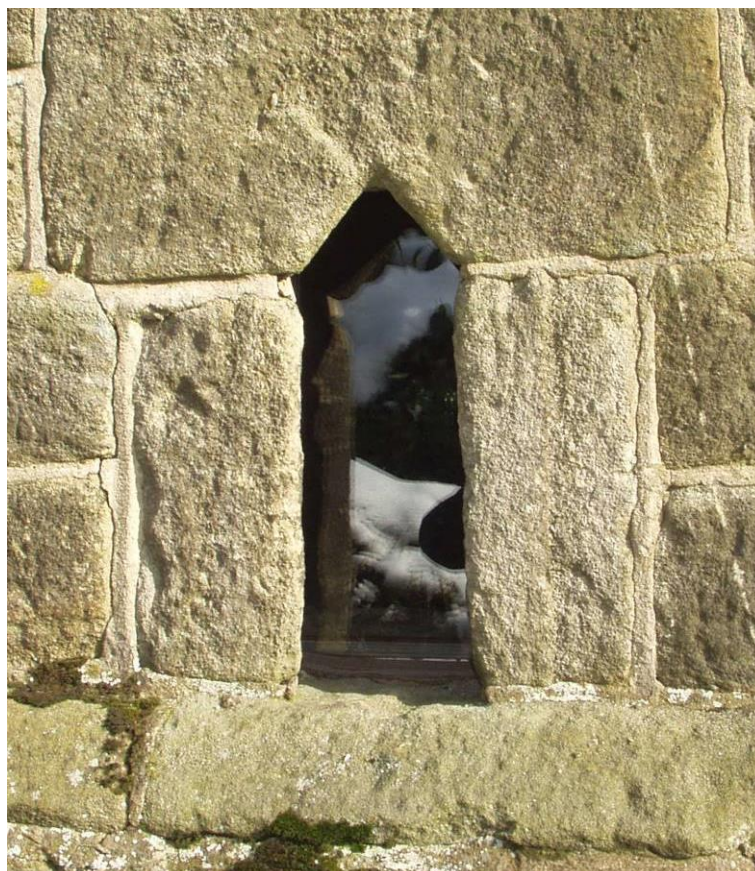
Glazing in a ventilation slot set well back into the reveal and fitted directly into the stone.

5.55 The glazing of ventilation holes should be set back within the reveal, in all circumstances.