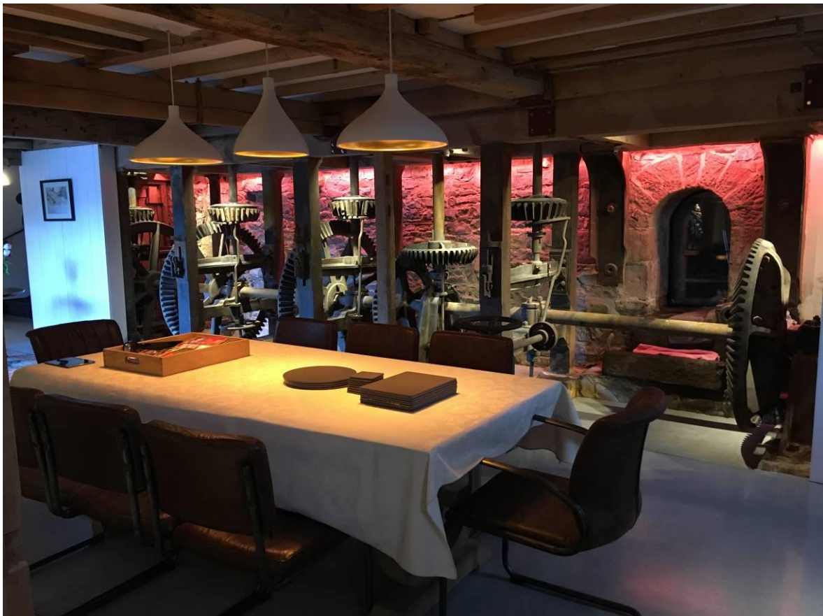
The water-power machinery retained in this mill conversion.