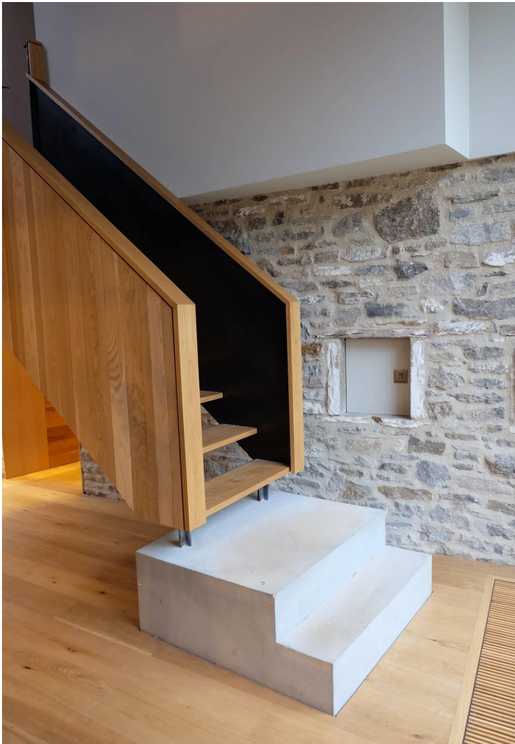
Contemporary design in a historic building - a simple palette of materials, including concrete, finished to a high specification in a barn conversion.