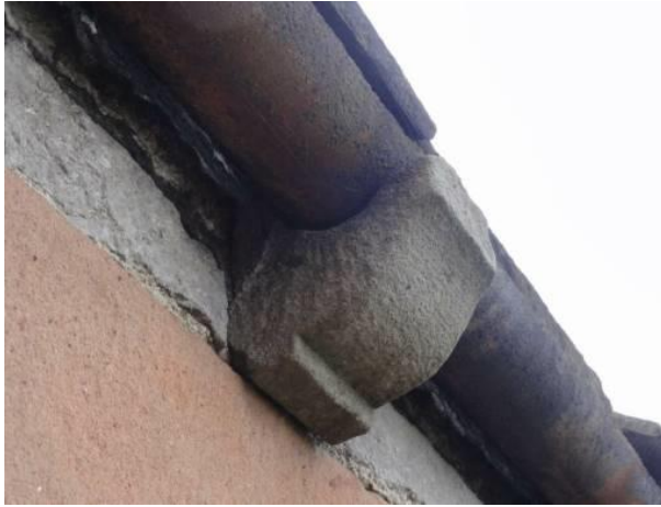
Stone support for a cast iron gutter on a historic barn.