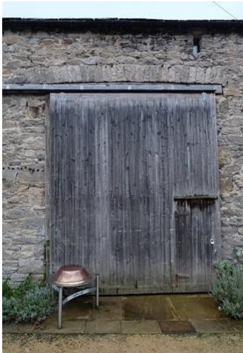
The 20 th century sliding door on this threshing opening, although not part of the original building, has been retained and can be closed to cover the new glazed opening behind it. This maintains the agricultural feel of the converted barn and helps to tell part of the building's history.