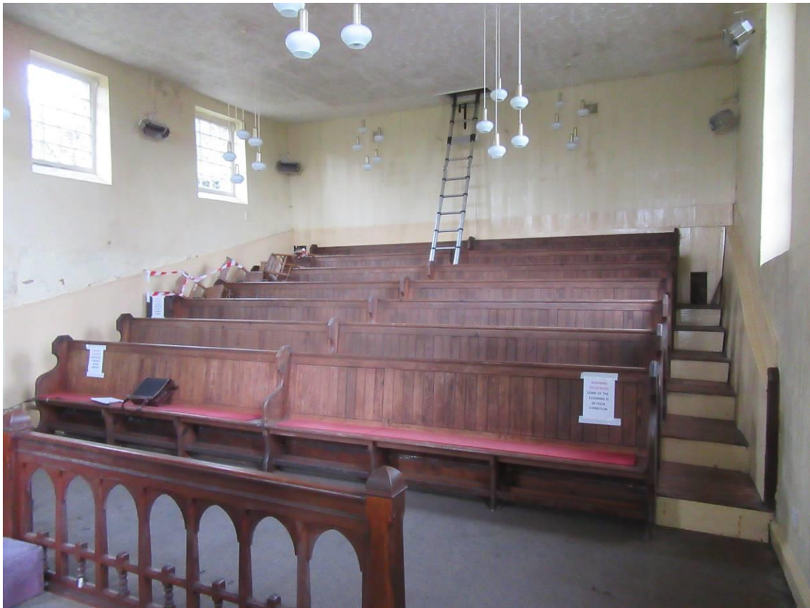
The simple open interior of a disused Methodist chapel with pews and other internal fittings. These spaces can pose design challenges that require a creative and sensitive response. (© Tom Crooks Architecture Ltd)