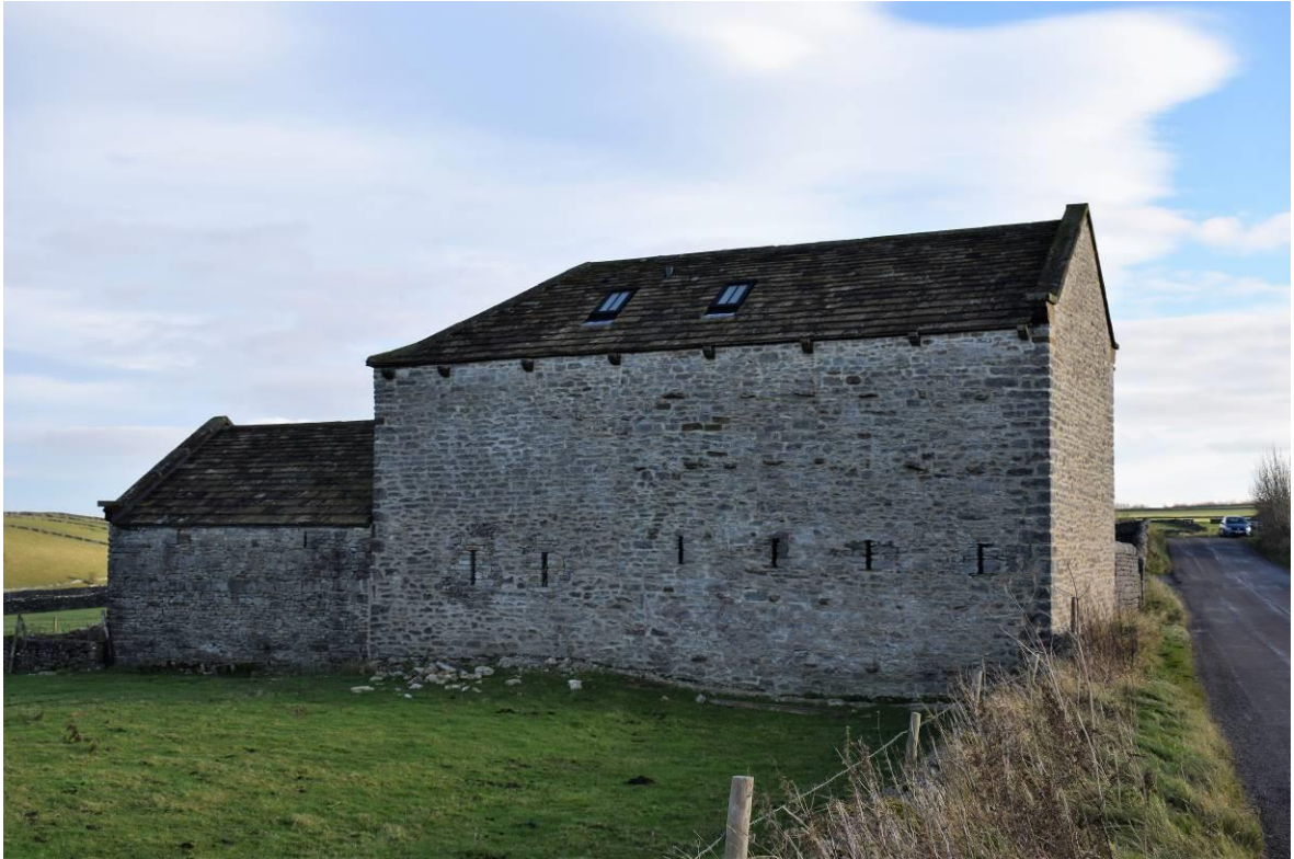
A barn after conversion – the solid-to-void ratio has been maintained. The only alterations on this elevation are two conservation rooflights and two additional vent slits to allow additional light to the interior. All the other original openings are on the opposite elevation.