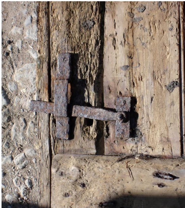
A simple iron latch on a historic door.