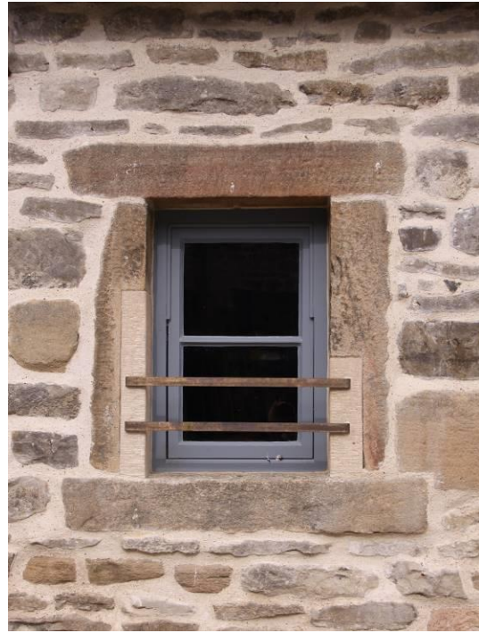
A like-for-like replacement of an historic window, including stonework repairs and new ironwork, based on evidence from the existing openings. (© Bench Architects)