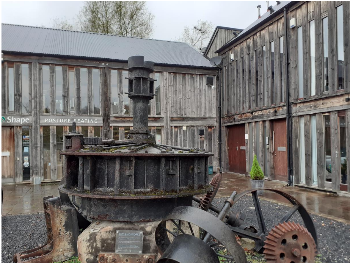
Creative new 'hit and miss' structure reflecting the character of a former timber drying shed, converted for use as office space