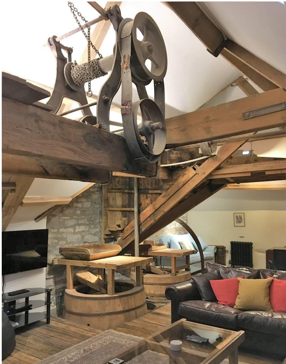
Machinery retained in its original position and creating a striking feature of interest in this former 18 th -century corn mill.