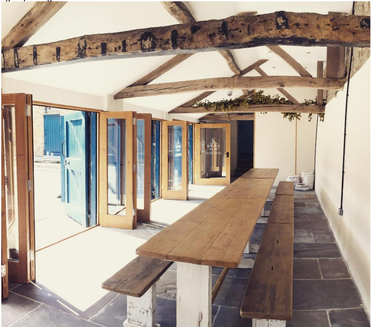
Large openings glazed to full height retain the character and bay arrangement of this former cart shed, now a Visitor Centre