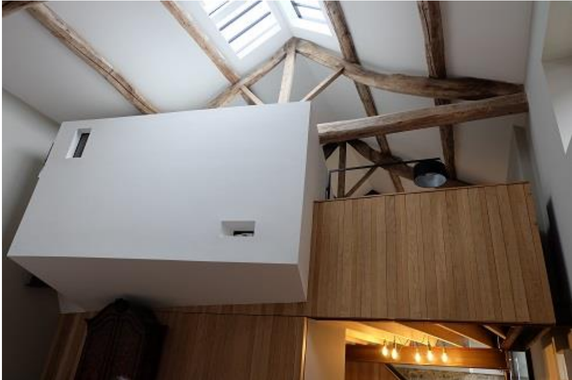
New interior structures in this barn conversion float free of the historic fabric and keep the full height space legible. (© CE+CA Architects)