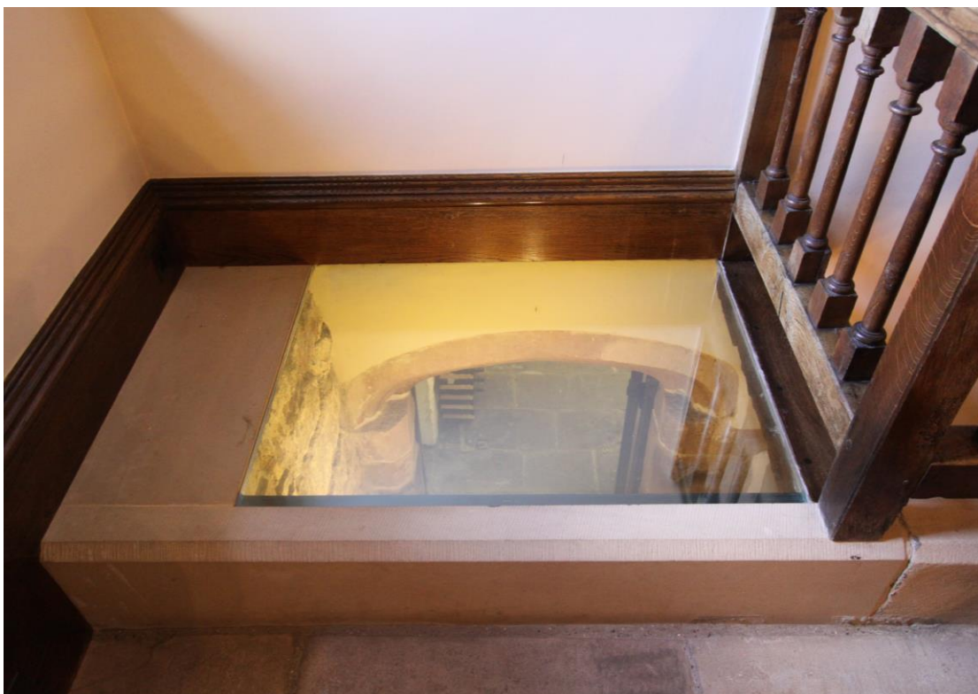
A glass panel in the floor brings borrowed light into a converted basement (© Bench Architects)