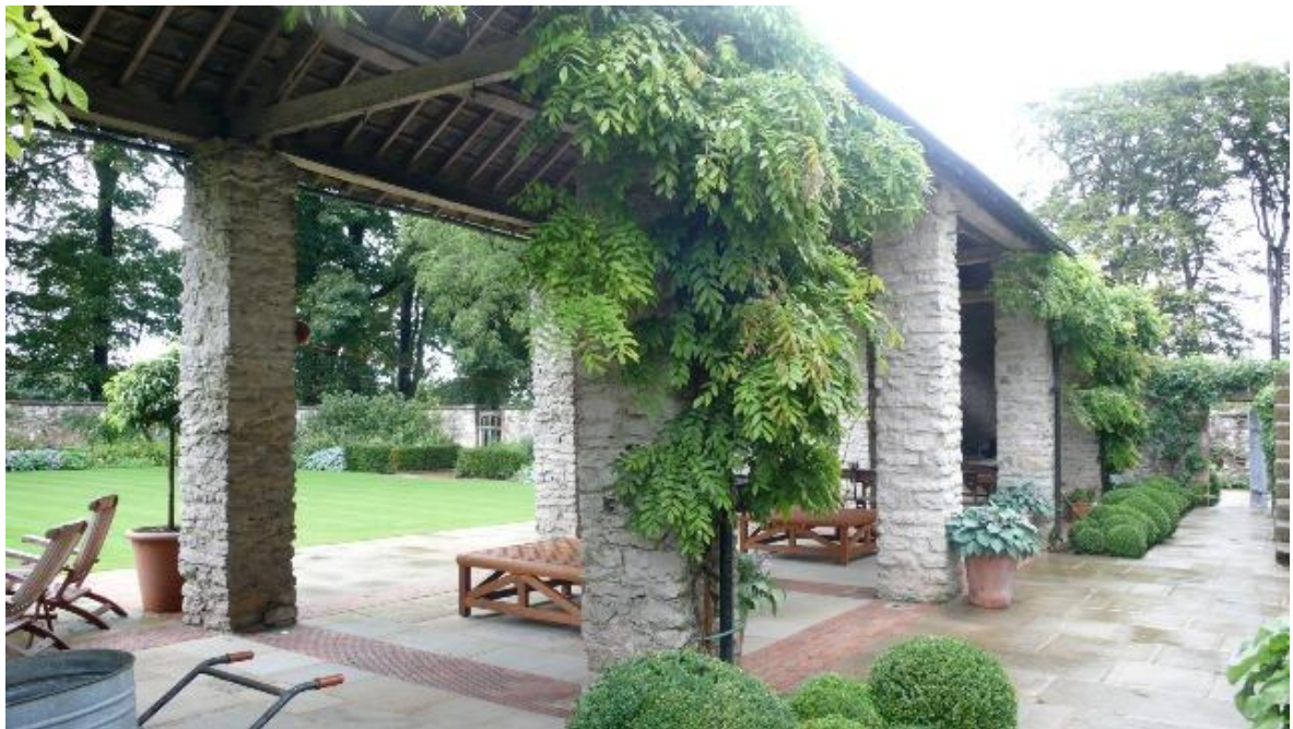
Open-sided barn converted for outdoor domestic use. (© Bench Architects)