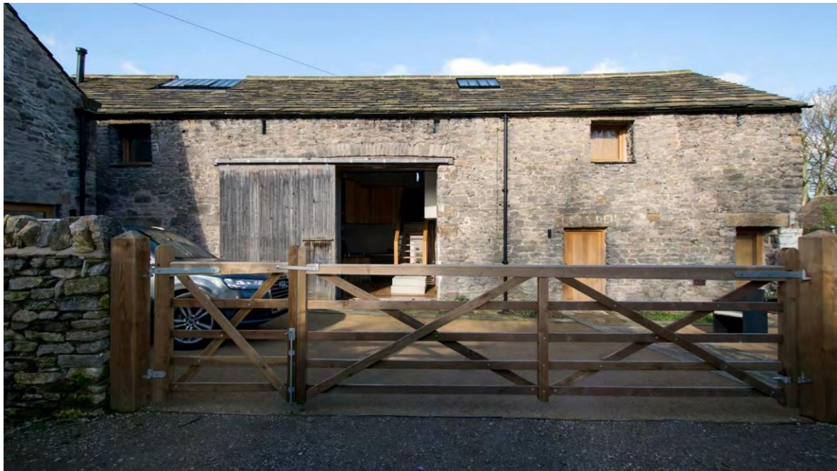
A barn after conversion to domestic use. The retention of the large sliding door and the careful use of existing openings with simple woodwork and internal shutters helps to maintain the agricultural character of the building. The interior is very modern but responds to the historic uses of space. (© CE+CA Architects).