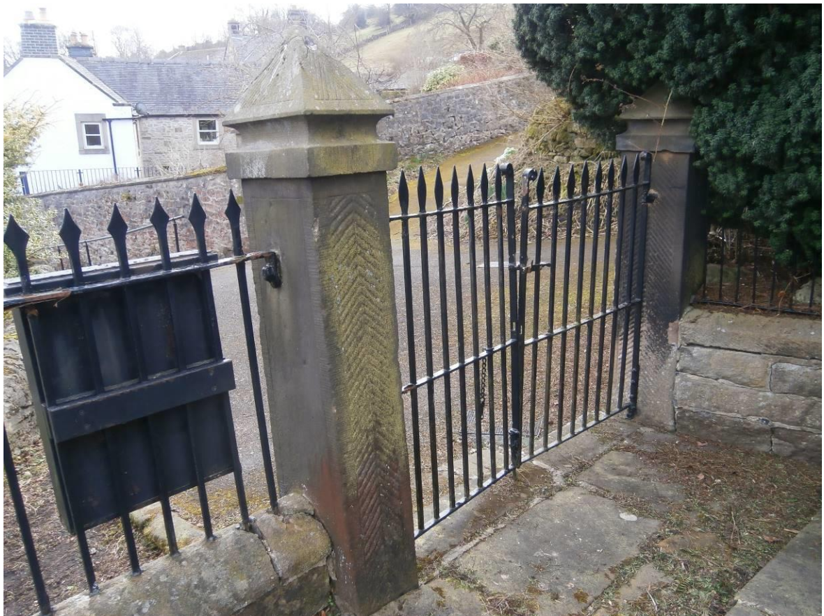
Gate piers and iron railings forming the boundary of a chapel curtilage.