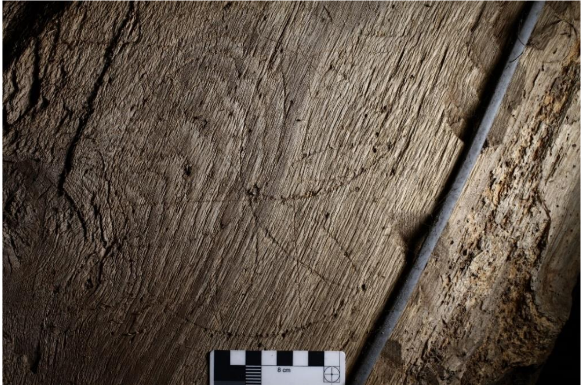
Hexafoil inscribed on a 16 th -century cruck blade in a barn.