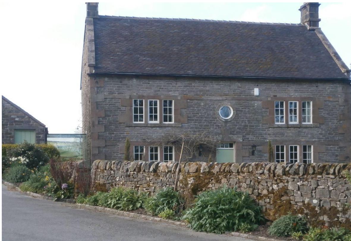
A 'light touch' glazed link between a house and converted barn – both buildings are listed.