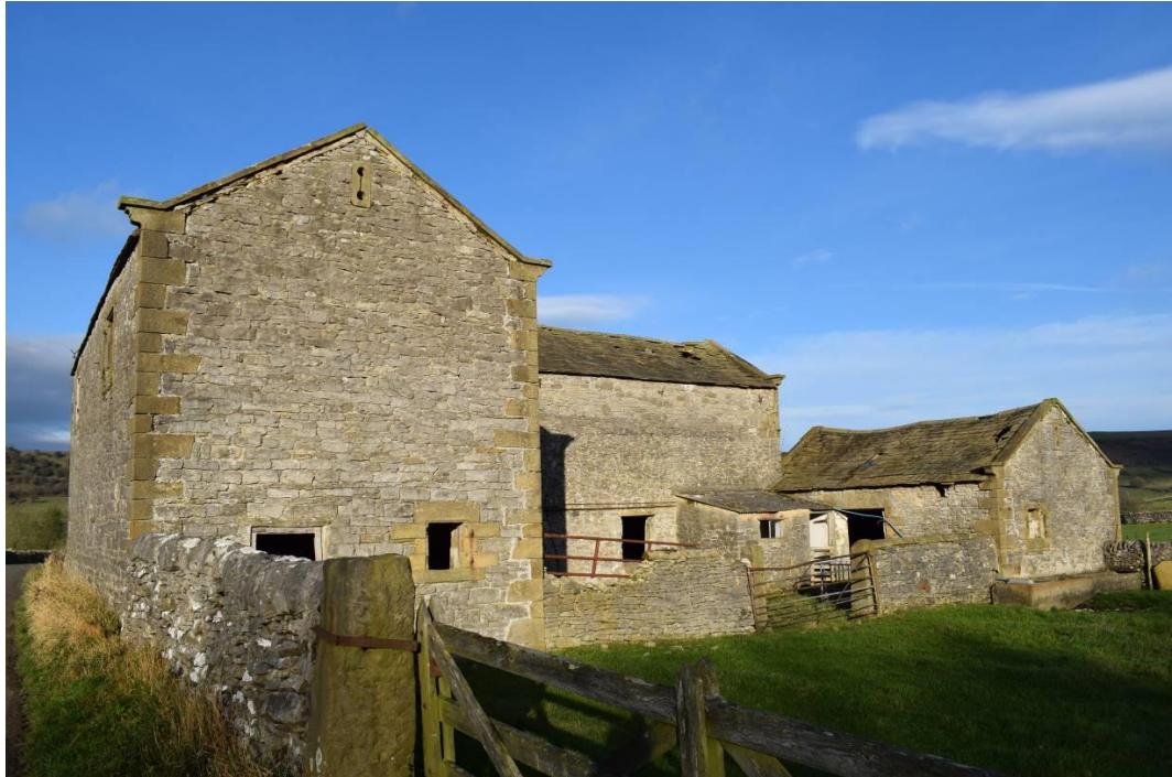
A Peak District outfarm, with buildings around a small yard. There are few openings in the upper parts of the elevations and there is very little surrounding curtilage.