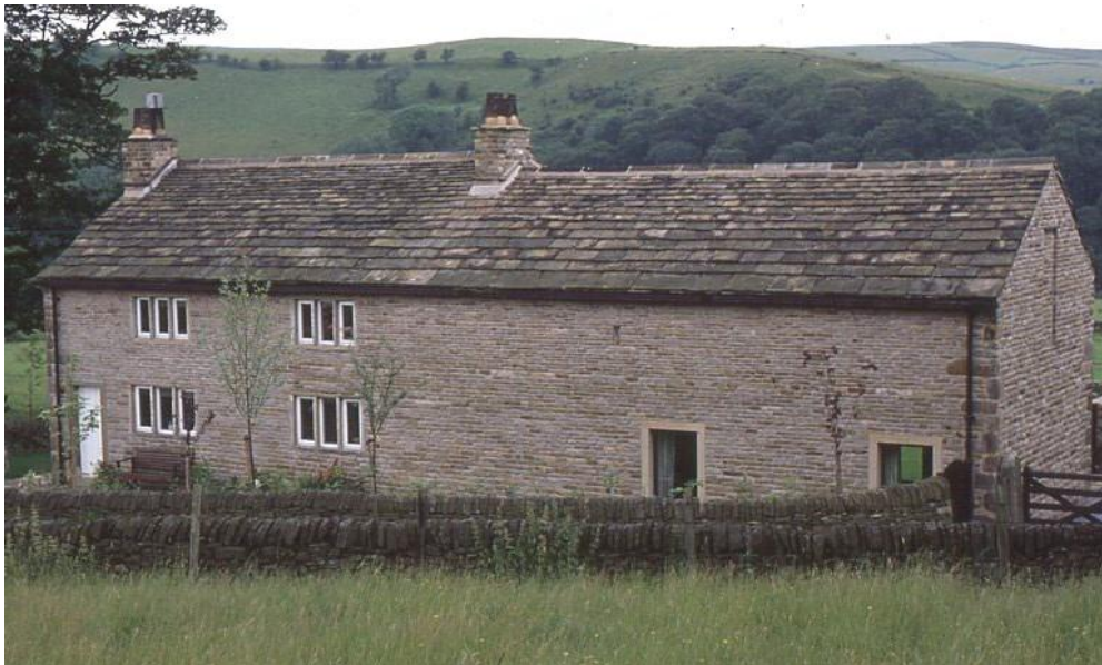
The barn adjoining the farmhouse has been converted to domestic use but retains a distinct utilitarian character.