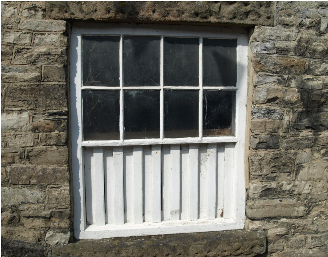
A traditional window with glazed upper and 'hit and miss' vents below.