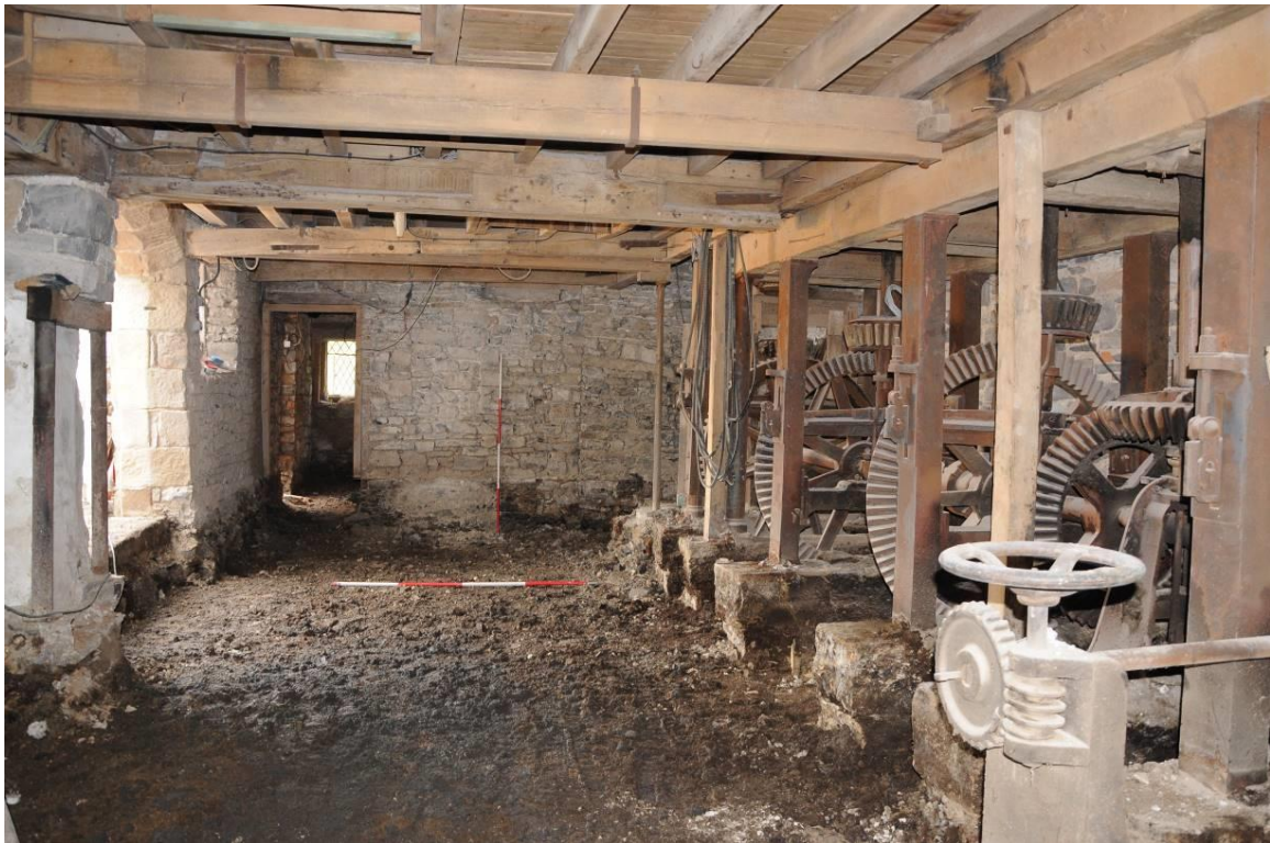
Water-power machinery in situ during archaeological recording of a mill before conversion.