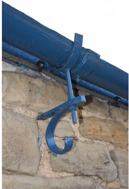
Metal bracket gutter support on a former smithy.