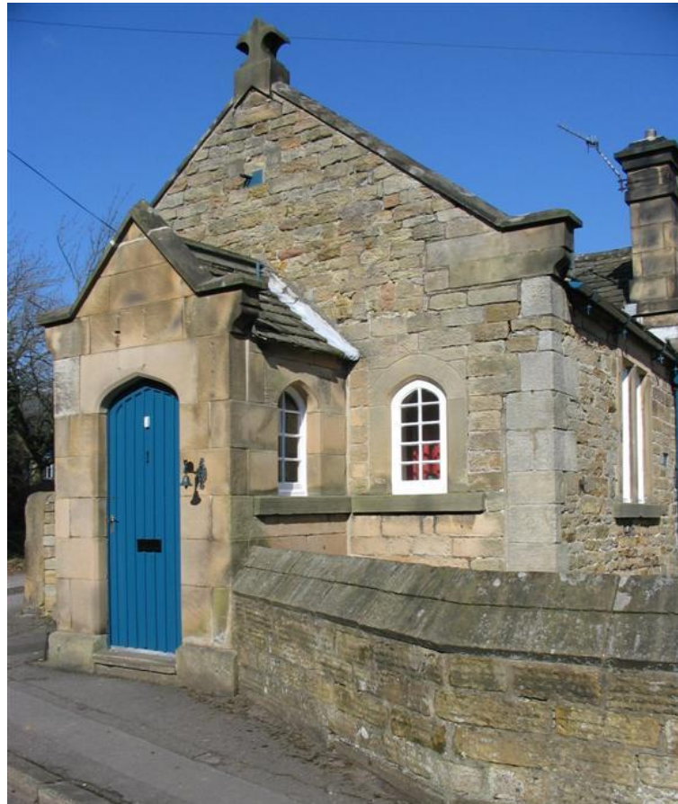
This former school is now a domestic dwelling, but retains its institutional character.