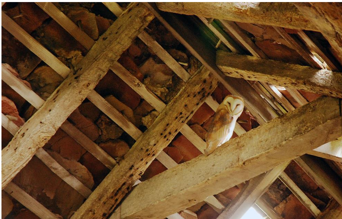
Barn owl.