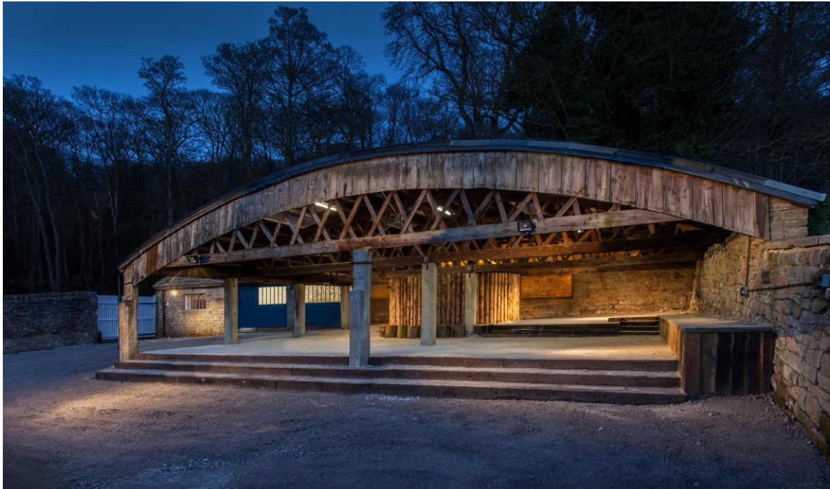
An early 20thC open-sided barn with Belfast trusses converted into a covered outdoor education space. The simple design and utilitarian materials reflect its former agricultural use.