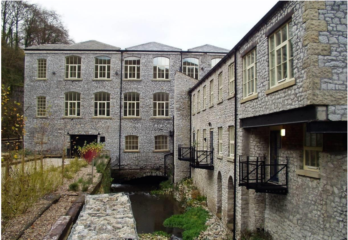
A mill converted for residential use. All openings are original, and a small number of new balconies respond to the industrial character of the building.