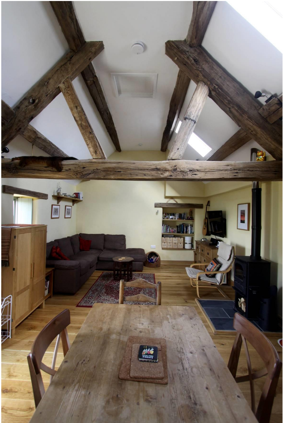
Barn converted into dwelling. (© Bench Architects)