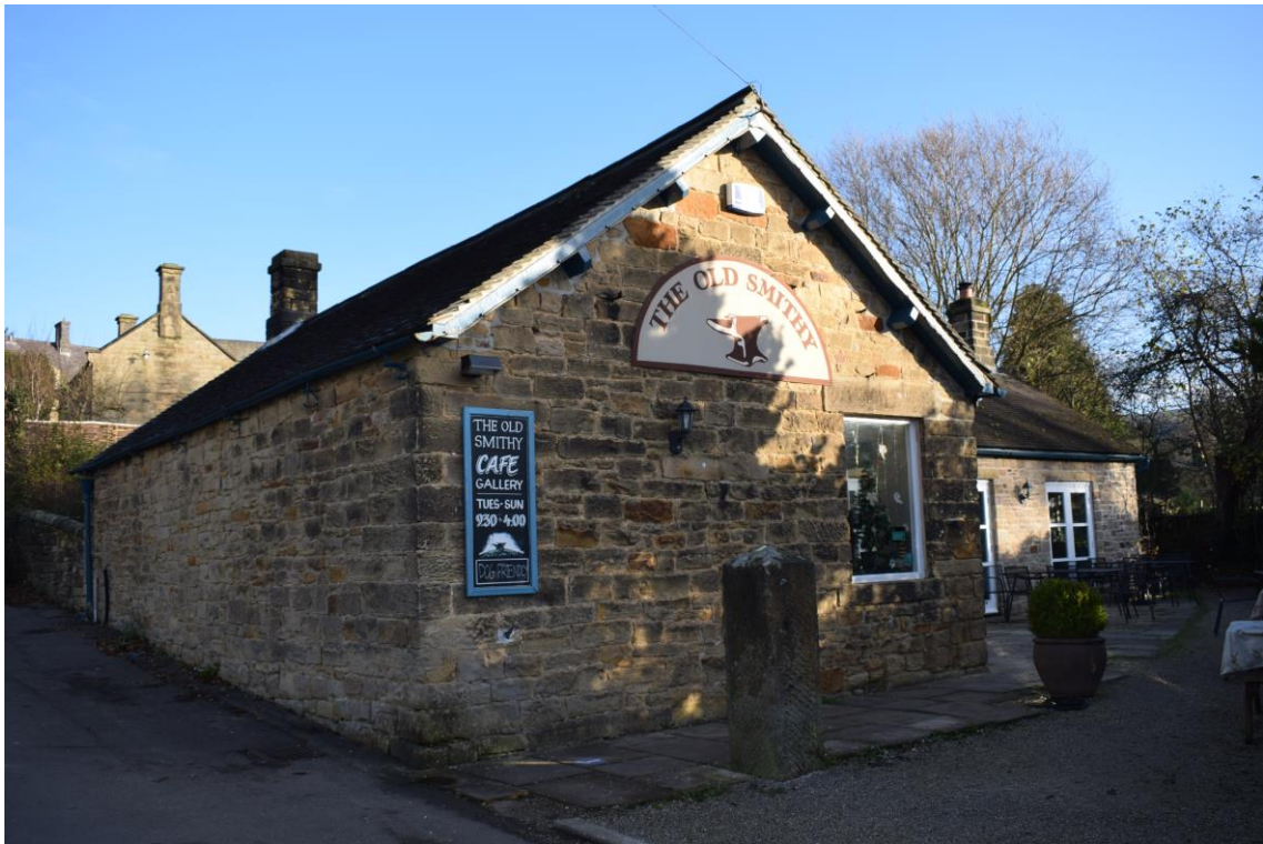
Former smithy converted into a café – the plain façade on the street frontage has been retained.