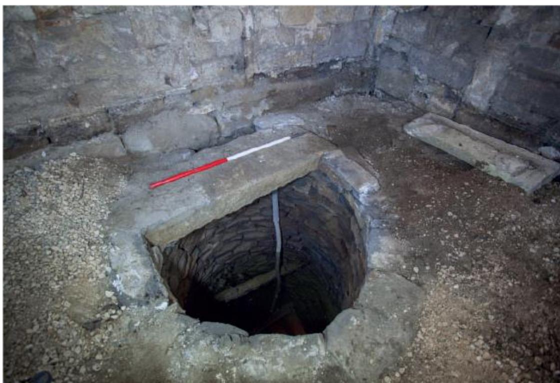
A well revealed below the flagstone floor inside a building.