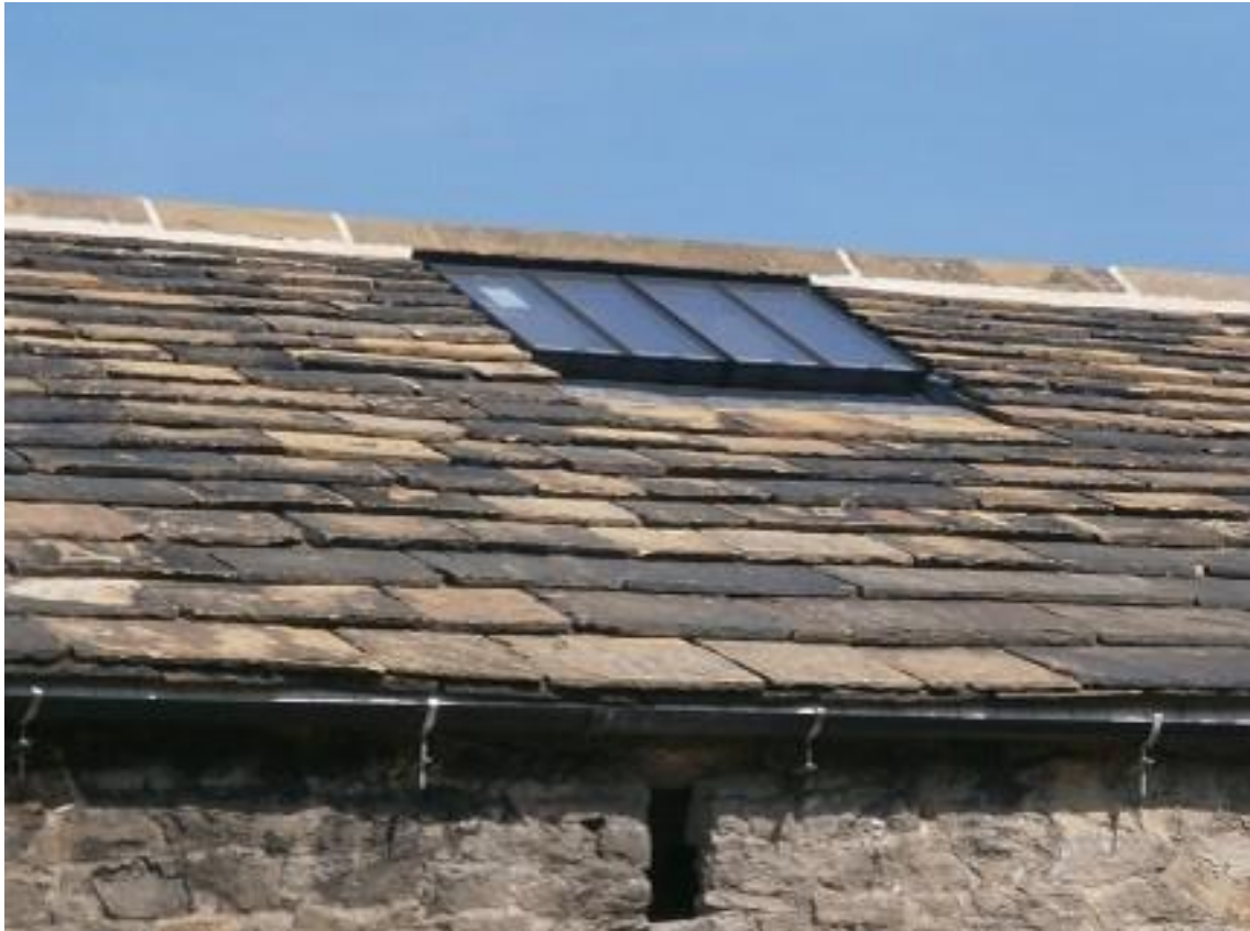
Industrial roof light set flush into a new stone roof along the ridge line of this converted barn. The agricultural feel of the barn is maintained.