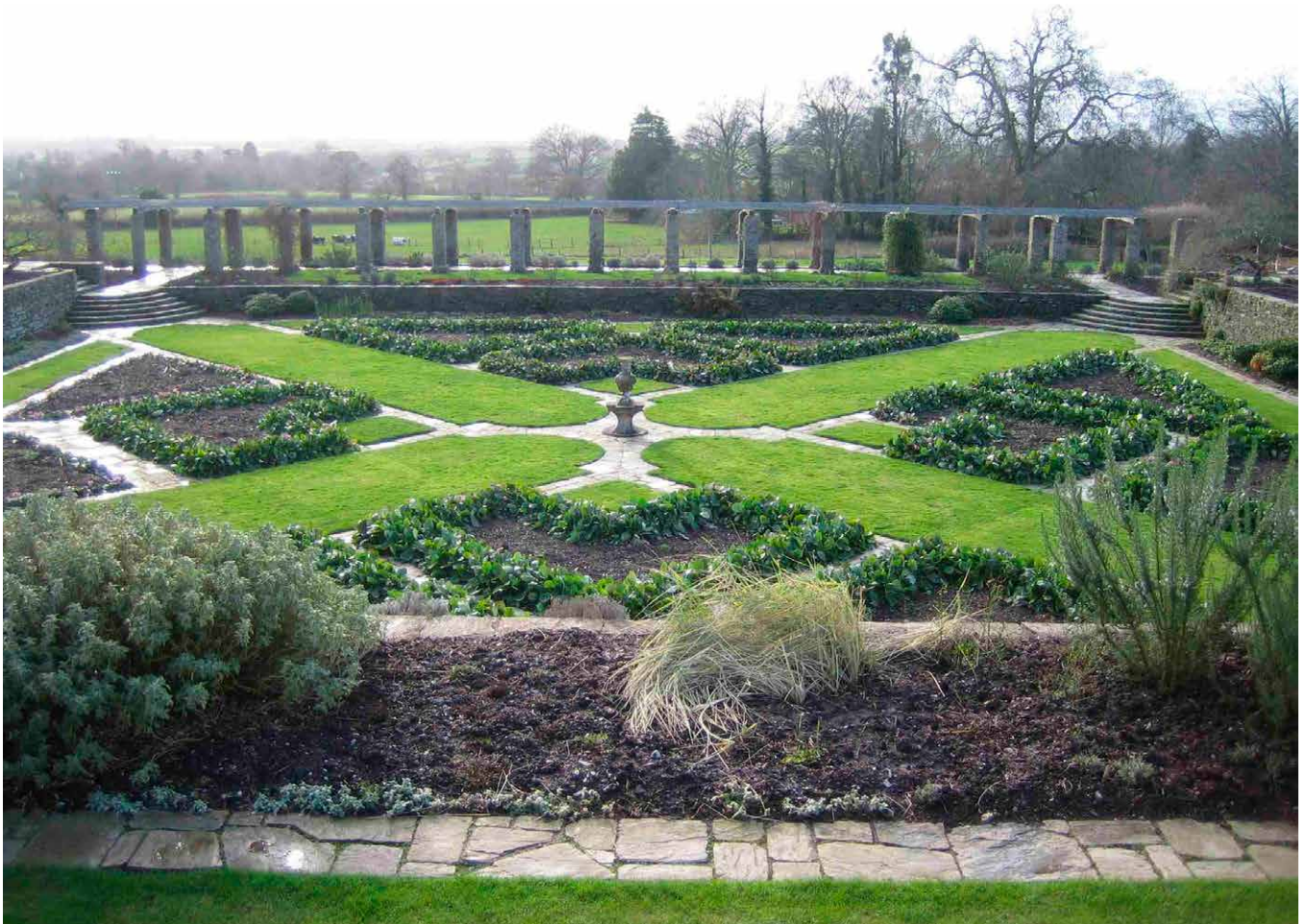
Figure 10 Hestercombe, Somerset. The register includes selected examples of the work of England's most highly-regarded landscapers and garden designers. Here the Hon. E W B Portman commissioned Edwin Lutyens to

In 1900 the landscape architect Thomas Mawson published his book The Art and Craft of Garden Making , which greatly influenced early twentieth-century garden design. Although Mawson drew on both revivalism and the Arts and Crafts movement, he also embraced the use of modern materials including concrete and asphalt for his hard landscaping, thus paving the way to modern design.