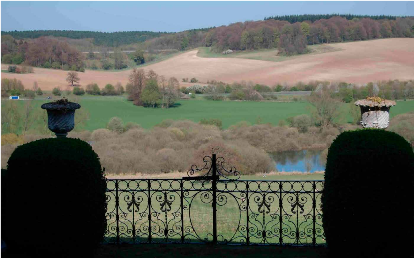
Figure 5 Shardeloes, Buckinghamshire. Charles Bridgeman's early eighteenth-century formal landscape was later modified by Nathaniel Richmond and by Humphry Repton. Then, as now, the main road from Aylesbury to

Amersham bisected the park, the north part of which is under the plough. Parks have often been ploughed (especially when corn prices were high), and this does not preclude registration. Registered Grade II*.