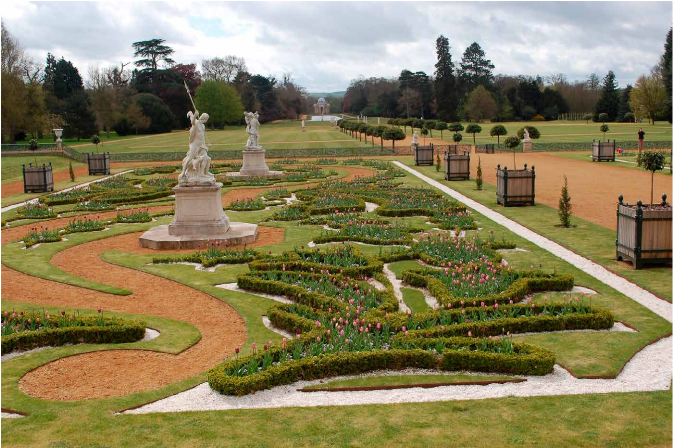
Figure 9 Wrest Park, Bedfordshire. One of England's grandest early eighteenth-century gardens, by George London and Henry Wise, with a banqueting house (listed Grade I) by Thomas Archer. There are two main later phases: of about 1760,

when 'Capability Brown' softened formal canals and undertook planting; and the 1830s, when formal parterres (now restored by English Heritage) complemented a new mansion in the French style. Registered Grade I.