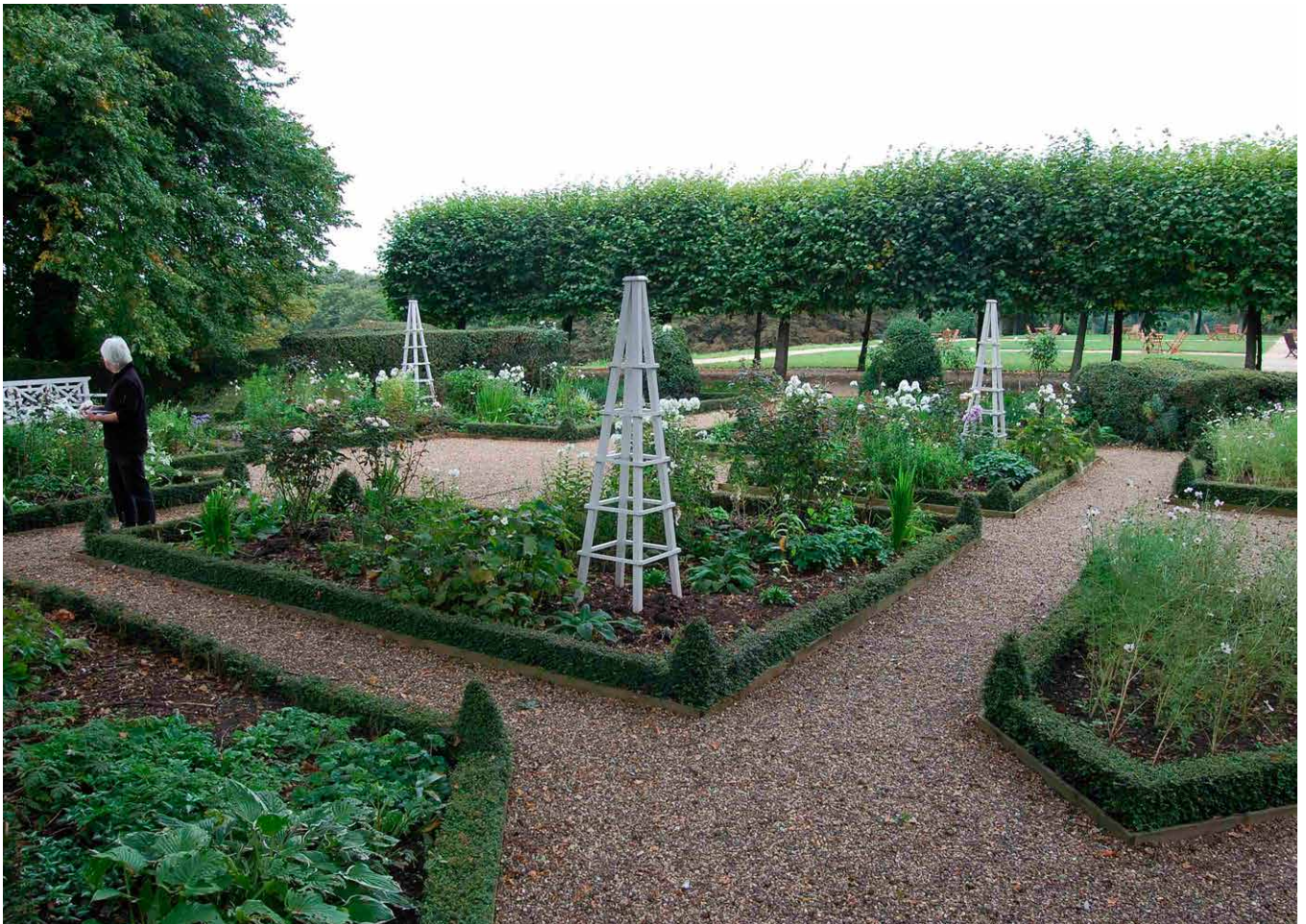
Figure 11 Kelmarsh Hall, Northamptonshire. Here the interest of the eighteenth-century landscape, an essential setting for James Gibbs's Grade I house of about 1730, is greatly enhanced by the gardens created

developed from 1930, and Rosemary Verey's garden at Barnsley House (Gloucestershire; registered Grade II), to which she moved in 1951, are often seen as the embodiment of this particular gardening tradition. Sackville-West defined her approach as 'profusion, even extravagance and exuberance, within confines of the utmost linear severity.' Also influential was the garden and arboretum created between the 1950s and 1970s by Sir Harold Hillier, a plantsman of world reknown, at Jermyns House, near Romsey (Hampshire; registered Grade II). During the twentieth century gardening became a leading pastime for a growing number of people as urbanisation and home-ownership became increasingly widespread. From the 1930s, many