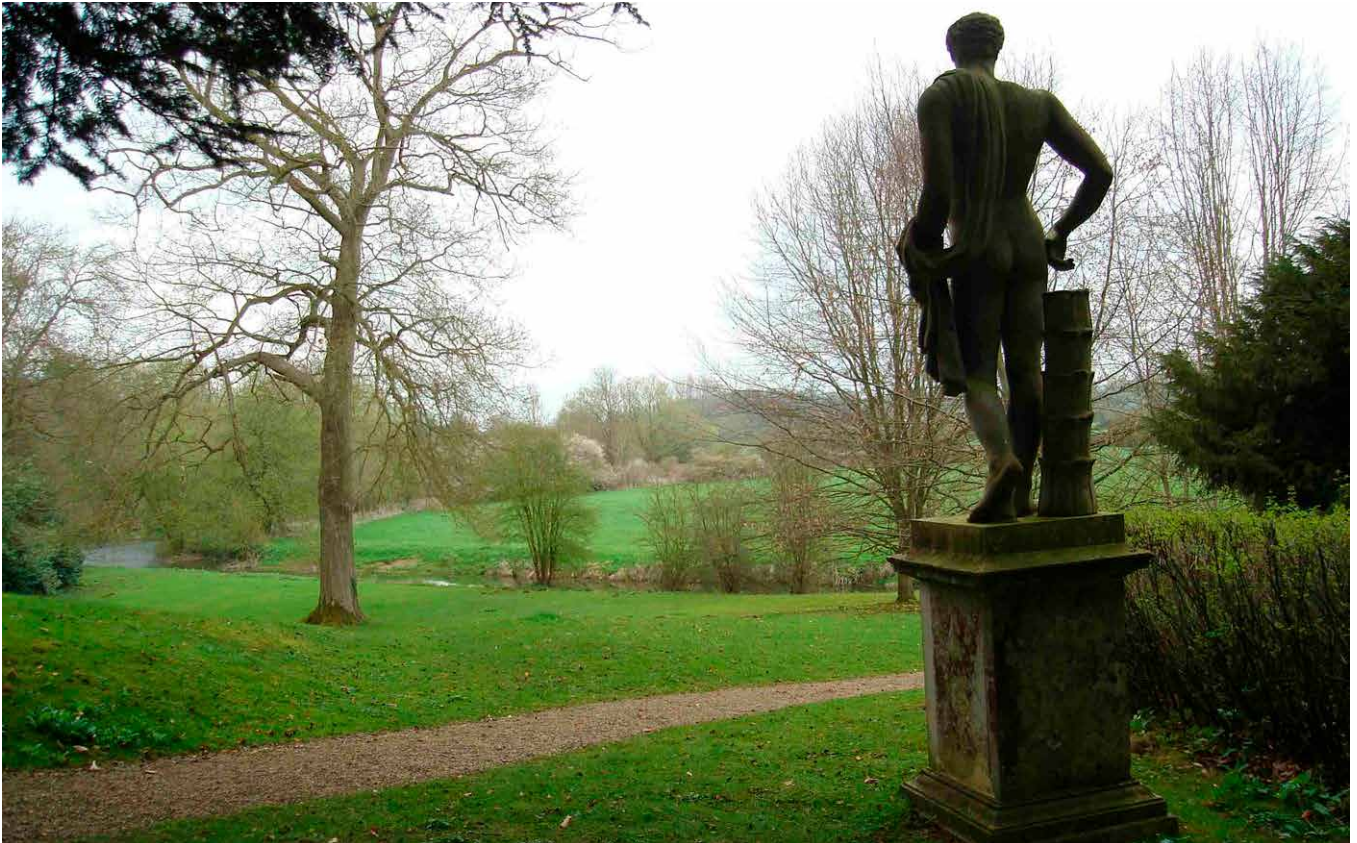
Figure 4 Rousham, Oxfordshire. Among England's most admired, and influential, gardens. Modified in the 1730s by William Kent, the gardens around the house were rich in garden buildings and statues, but also – notably

– looked over the River Cherwell, 'calling in' (to use Alexander Pope's phrase) the countryside beyond. That the garden has seen little later alteration adds considerably to its special interest. Registered Grade I.