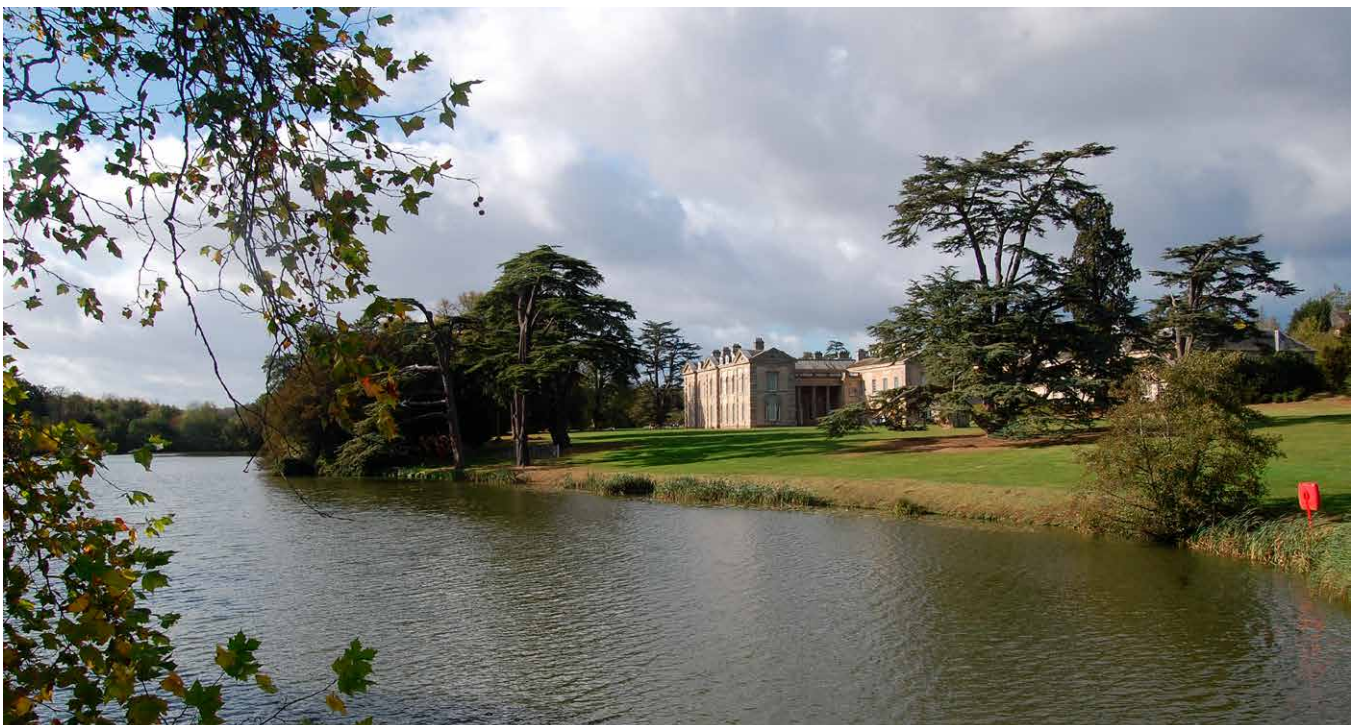
Figure 6 Compton Verney, Warwickshire. Lancelot 'Capability' Brown landscaped the park between 1768 and 1774 for John Verney, 14th Baron Willoughby de Broke. This followed on from Robert Adam's remodelling of the

Landscape parks also attracted criticism as they lacked interest around the house. Families wished to have grounds to walk in, shrubs and flowers to provide colour, scent, and seasonal change, and a degree of shelter and privacy from the world beyond. Humphry Repton (1752-1818), who set up in business in 1788 with an aspiration to become England's leading landscape designer, initially worked in imitation of Brown's style but from about 1800, as evidenced by his before-and-after 'Red Book' proposals (roughly 125 are known to survive