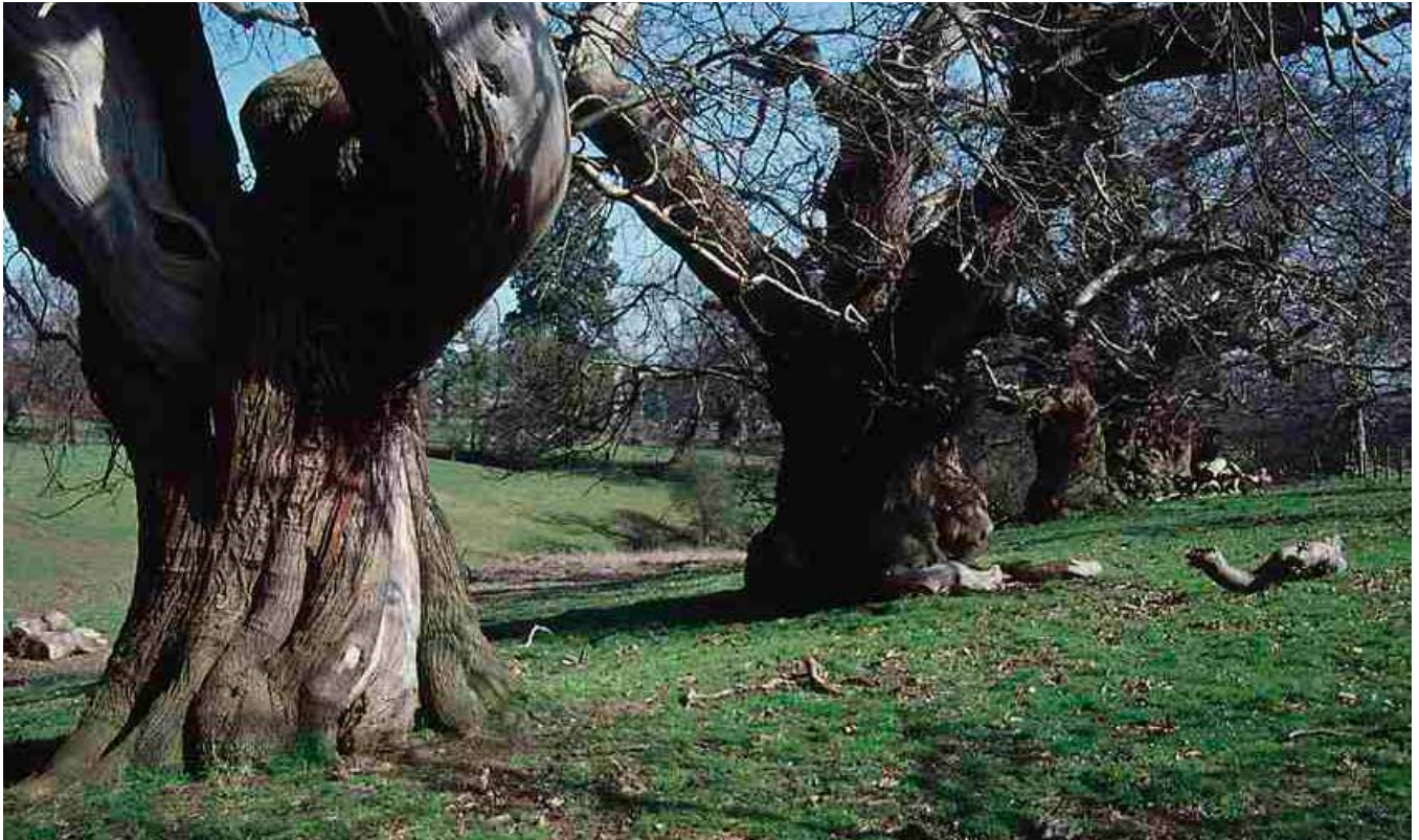
Figure 3 Croft Castle, Yarpole, Herefordshire. Trees have often played an important part in landscaping schemes, whether formal or informal. Veteran trees can evidence otherwise lost phases of a site's history. This line of sweet chestnuts

defining a ride dates from the mid seventeenth century, and forms the most coherent survivor of an ambitious layout of avenues and plantations. Registered Grade II*, and a National Trust property.